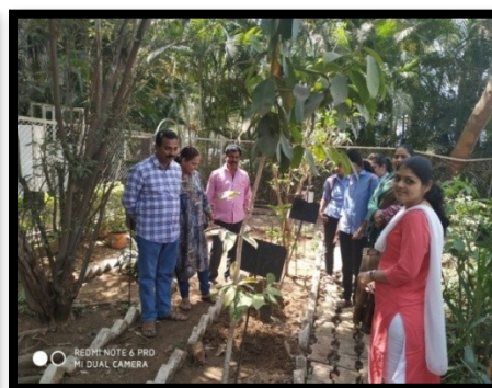
Teachers elaborating importance of Tree plantation