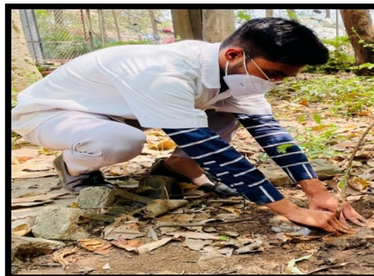
Active participation of NSS volunteers in Tree plantation